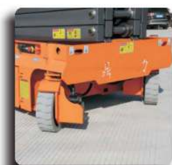
Compact Turning Radius