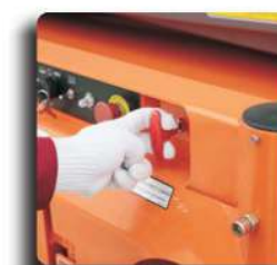
Emergency Lowering System