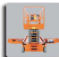
Swing Out Tray