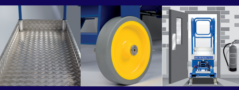
Non-slip, non-corrosion decking