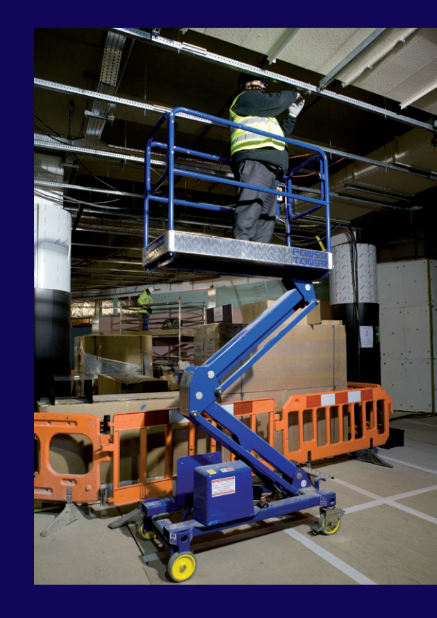
Passes easily through single doorway or into passenger lifts.

sales@powertowers.co.uk www.powertowers.co.uk