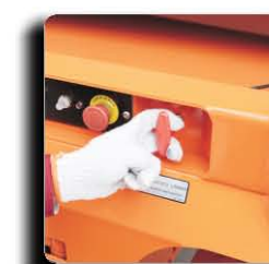
Emergency Lowering System