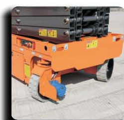
Compact Turning Radius