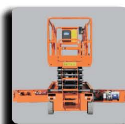
Swing Out Tray