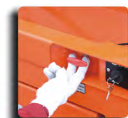
Emergency Lowering System