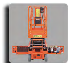
Swing Out Tray