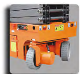
Tight Turning Radius